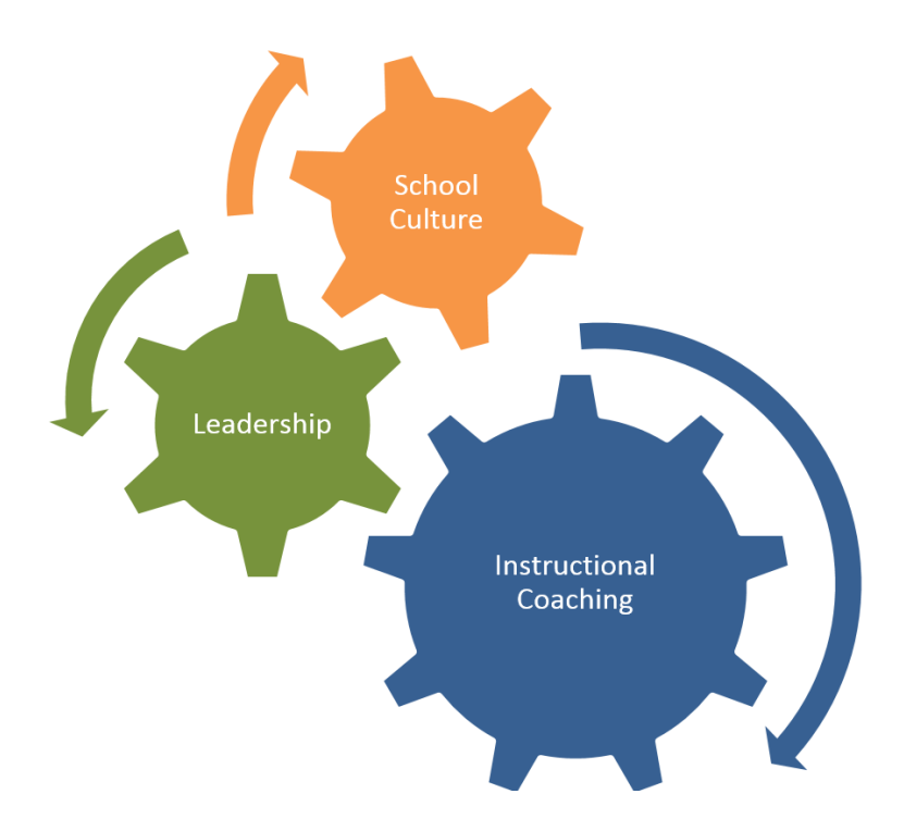
Figure 9. The Impact of Coaching Implementation.

coaching model (as described in the framework) in conjunction with strong leadership creates a synergistic cycle of continuous improvement that strengthens the school culture. Together, these components improve teacher practice and positively impact student achievement.